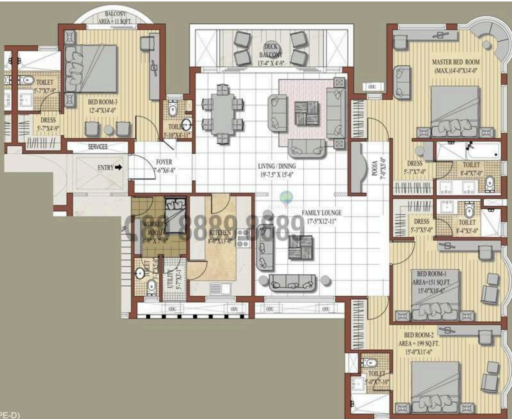
UNIT - 4 BHK+FAMILY (TYPE-D) (5TH FLOOR)