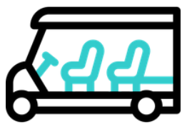
GOLF CART SHUTTLES