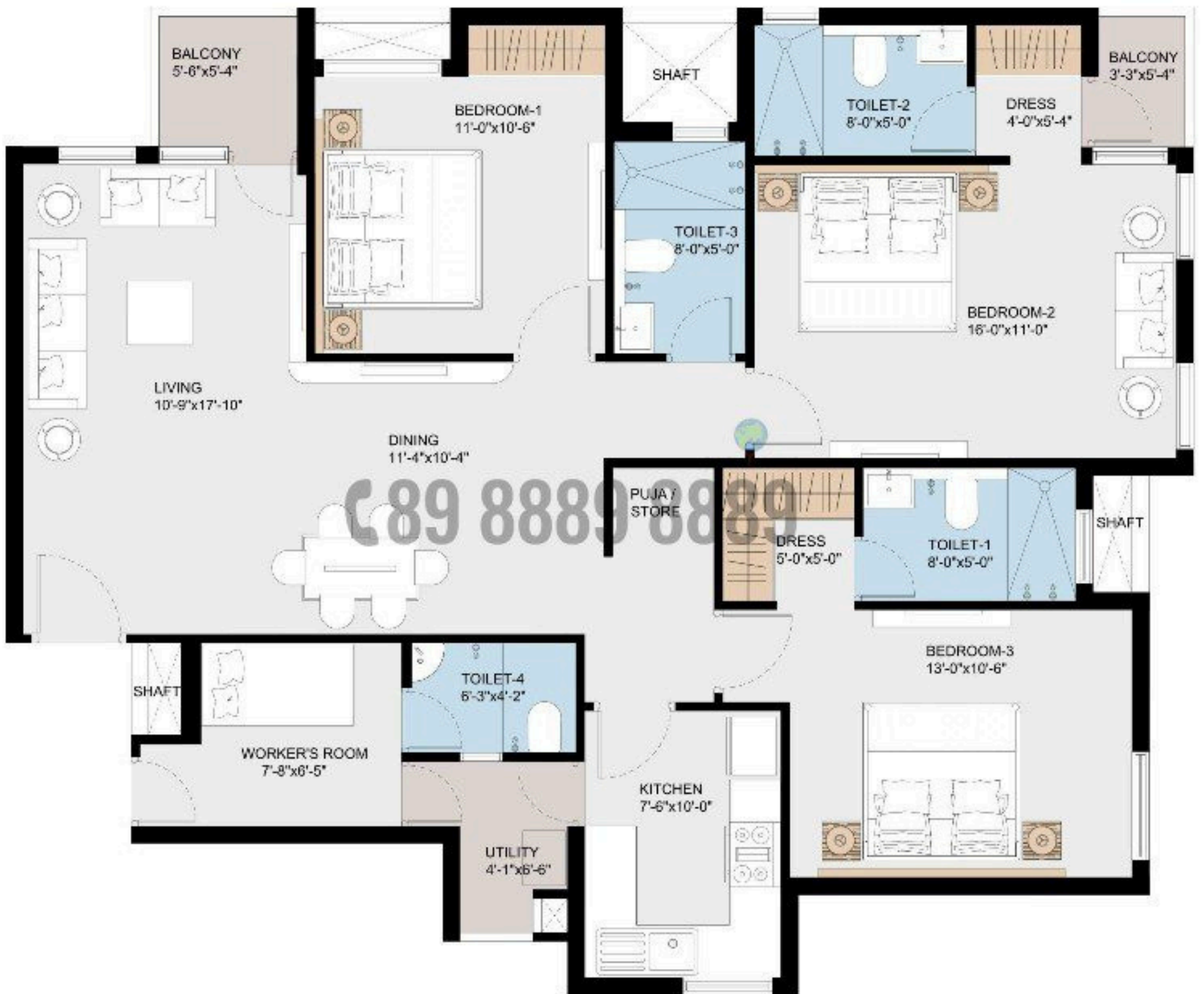
3BHK- TYPE C